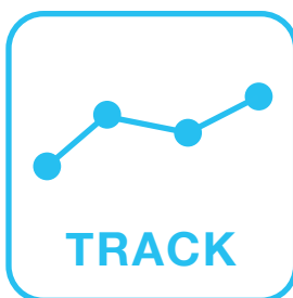
CONNECTS TO LIFEINA