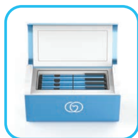
FOR USE WITH LIFEINABOX